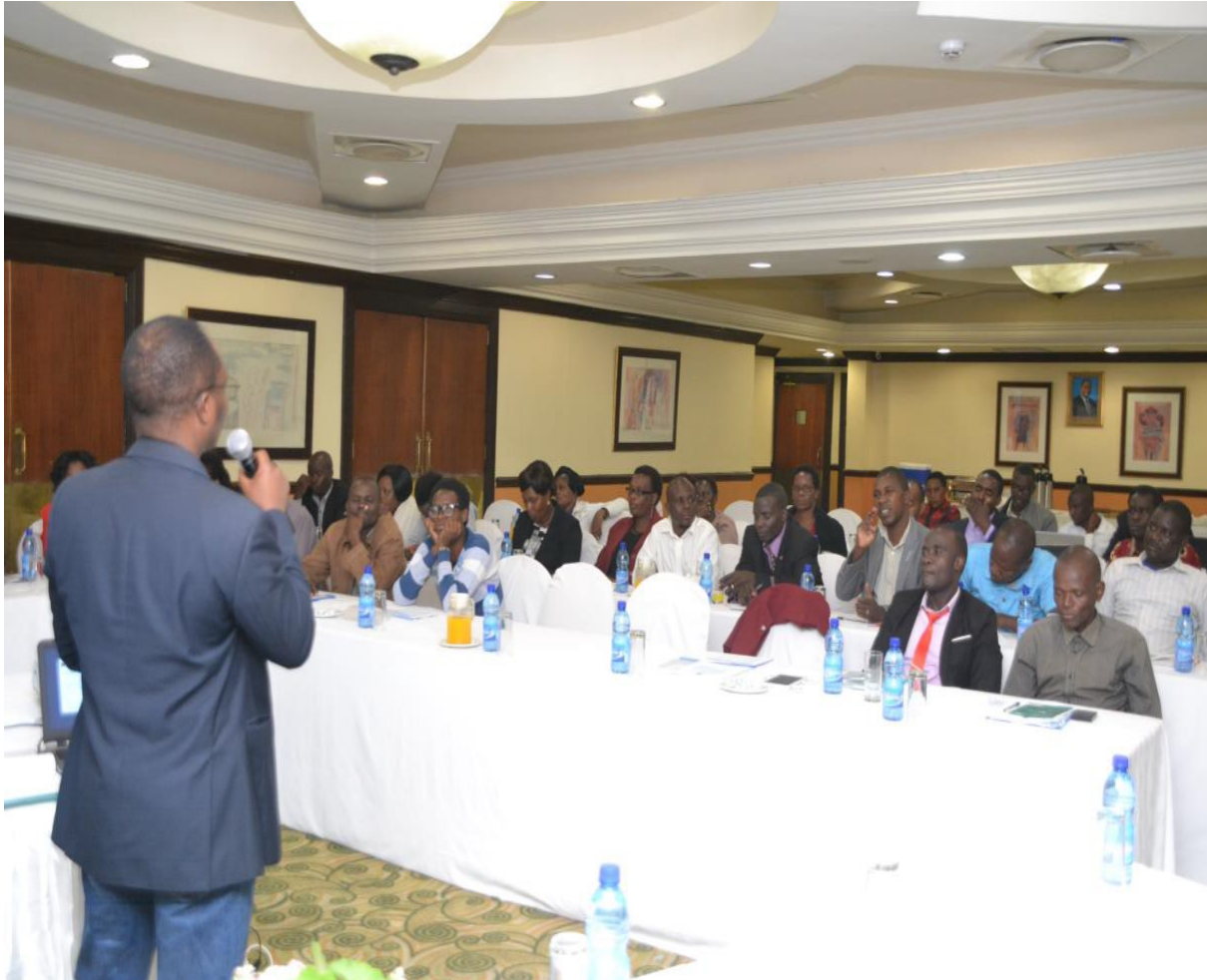
Training on ID Registration Standard Operating Procedures (SOPs)