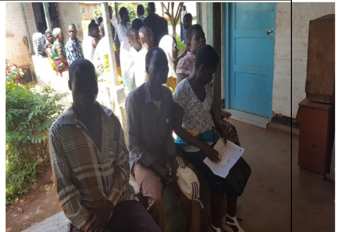
Continuous registration in progress in Thyolo: Citizens patiently waiting to register for National ID card.