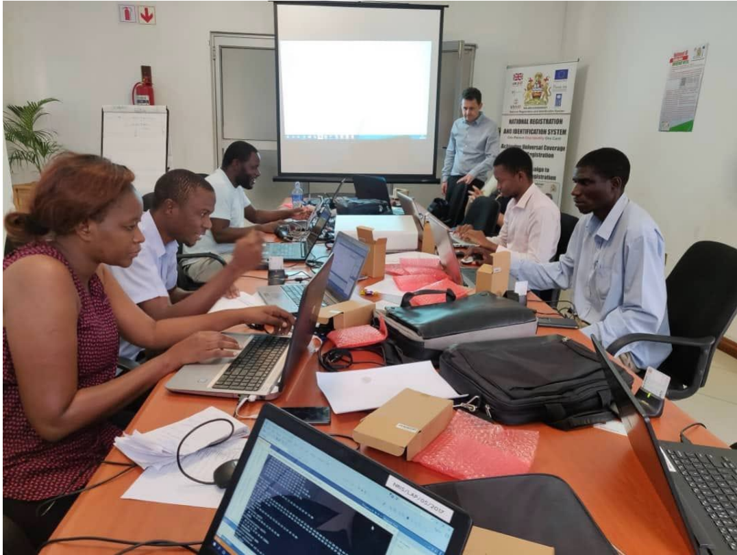
Training on Source Code Transfer in NRIS conference room