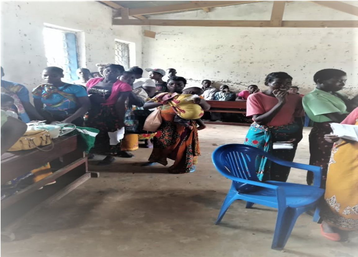
Malawian citizens collecting their national IDs