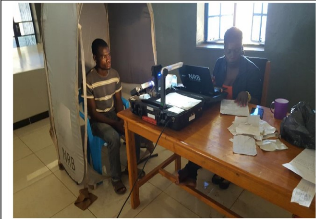
Continuous registration in progress in Mulanje: An NRB Officer assisting a citizen to register for National ID card.