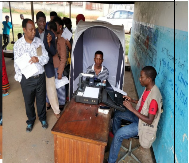
Continuous registration in progress in Lilongwe: An NRB Officer assisting a citizen to register for National ID card.